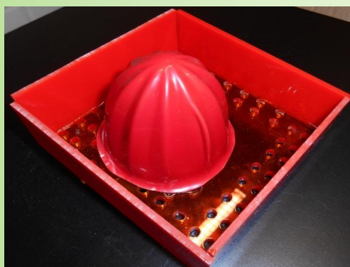
This product connects to discarded plastic bottles, allowing you to juice lemons into your drinking water. Team members – Isaac Lobatto, Charlie Leboff, Yuval Proud, Omer Samuel