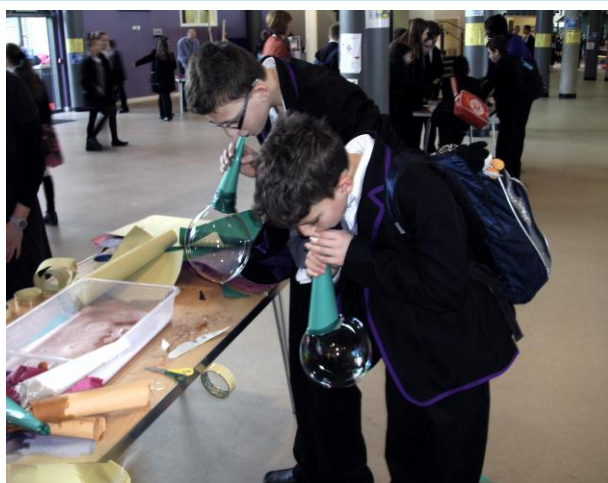
Photographs from Einstein's Birthday Party