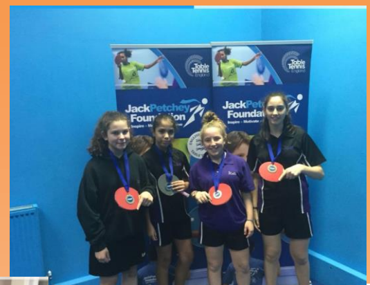
KS4 Girls Table Tennis North London Champions