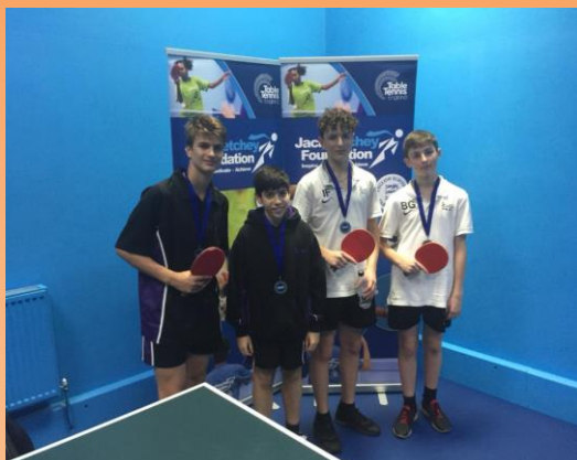
KS4 Boys Table Tennis North London Runners Up