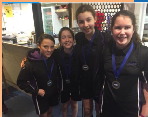
KS3 Girls Table Tennis North London Champions