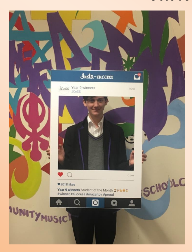
October – Ace Rockman 9R