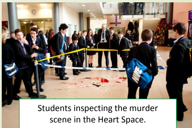
Students inspecting the murder scene in the Heart Space.