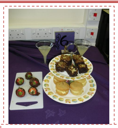
Silver Neve Grant 9Y